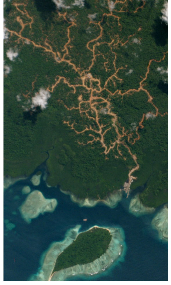
Ochre-colored logging roads lead to a newly-constructed port on the Indonesian Island of Pulau Pini.