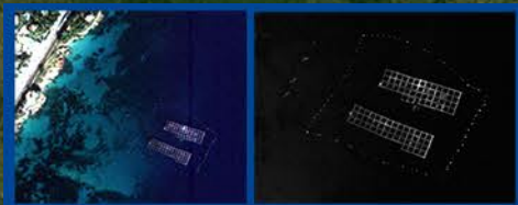
Seabass & seabream cages, Cannes (France). Pleiades image on 24/12/2011, CNES.