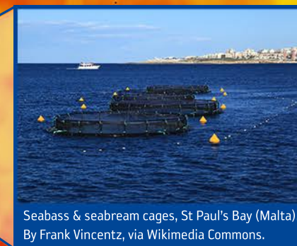
Seabass & seabream cages, St Paul's Bay (Malta).