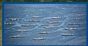
Example of mussels aquaculture on racks, Spain